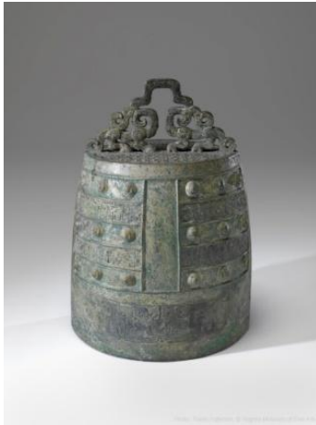
Bell (Niuzhong) , 6th century BCE Chinese, Eastern Zhou dynasty Bronze 12½"H x 9⅞"W x 7½"D (13.75 x 23.18 x 19.05 cm) Adolph D. and Wilkins C. Williams Fund