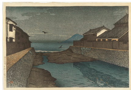
Kawase Hasui (Japanese, 1883-1957) Hori River, Obama from the series Souvenirs of Travel, First Series, early autumn 1920, woodblock print, ink and color on paper. Virginia Museum of Fine Arts, Richmond. René and Carolyn Balcer Collection