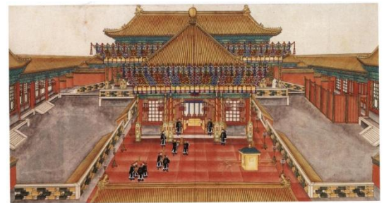
Emperor Guangxu's Wedding Ceremony, 1889. Album leaf; ink and color on silk. Image: H. 60.96 cm (24 in.), W. 111 cm (43.70 in.) Palace Museum, Beijing

This landmark exhibition will feature more than 180 works of art from the collection of the Palace Museum, Beijing (“The Forbidden City”). The largest art museum in China and the largest palace in the world, it is located in the center of Beijing within the ancient Imperial Palace, where 24 emperors of the Ming and Qing dynasties resided from 1420 until 1924, when the last emperor was expelled. The Palace Museum was established in 1925 and holds more than 1.8 million works of art and artifacts. The exhibition is part of a groundbreaking multi-year collaboration between VMFA and the Palace Museum. The exhibition will offer a broad perspective on Imperial China during the Ming (1368-1644) and Qing (1644-1911) dynasties with a focus on the 17th and 18th centuries. Featured works—ranging from portraits of emperors and empresses, court paintings, religious sculpture, and ritual objects to fine ceramics, bronzes, lacquerware, jade, costumes, textiles, and furniture—will be combined with 3-D printing technology and architectural features to offer visitors an immersive experience, as if passing through the Forbidden City during the height of its glory and splendor. Forbidden City is presented by Altria Group and the E. Rhodes and Leona B. Carpenter Foundation. Curated by Li Jian, E. Rhodes and Leona B. Carpenter Curator of East Asian Art.