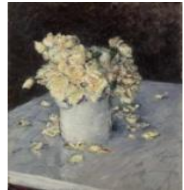
Gustave Caillebotte, Yellow Roses in a Vase , 1862. Oil on canvas; 53.34 x 46.355 cm. Dallas Museum of Art.