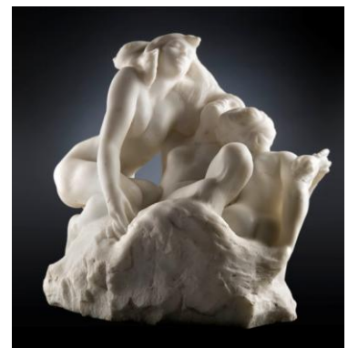
The Sirens , about 1887-1888. Marble. Montreal Museum of Fine Arts.