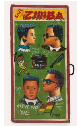
Barber's Sign , ca. 1957, unidentified artist, Ghana, paint on wood panel, 47 3/4 x 24 in. Gift of Kenneth and Bonnie Brown

Two recently acquired works in the African collection provide insight into far-reaching social and economic changes associated with the independence movement that swept across Africa during the 1950s and 1960s, bringing an end to European colonialism officially, if not in reality. The upbeat Barber's Sign from Ghana, infused with the optimism of the new era, suggests modern hairstyles for fashionable personal identity, while celebrating the name Ghana along with the red, yellow, green, and black state colors the new nation adopted after declaring autonomy from Britain in 1957. Revealing another aspect of the transition, the haunting photo montage, Untitled 21 , from the suite Mémoire , by Congolese artist, Sammy Baloji investigates the impact of industrial development in the Belgian Congo during the colonial era and its demise after independence in 1960. In this focus installation, both the sign and the photo montage are presented with related works to portray the historic context more broadly and cast a sharper focus on the nature of the changes in society and art that have played out in Africa during the second half of the 20th century. Curated by Richard B. Woodward, Curator of African Art.