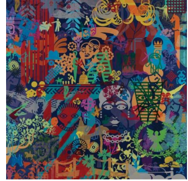
Ryan McGinness (American, born 1972) Art History Is Not Linear (VMFA) detail, 2010. Acrylic on panels. Virginia Museum of Fine Arts, Richmond. National Endowment for the Arts Fund for American Art

Commissioned by VMFA, the artist's 16-panel painting contains 200 icons inspired by works from the museum's collection. A three-part exhibition, the first gallery provides a glimpse of McGinness' studio practice, the second displays a selection of the objects McGinness chose from the museum's collection alongside his sketches and final image, and the last portion features early works the artist made while growing up in Virginia Beach. The exhibition promises to engage a wide audience, and an exciting array of education programs will encourage young viewers to seek out favorite works in the collection and actively participate in their own process of exploration and interpretation. Curated by John B. Ravenal, Sydney and Frances Lewis Curator of Modern and Contemporary Art.