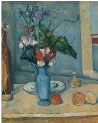
Paul Cézanne (French, 1839–1906) The Blue Vase , ca. 1889–90, oil on canvas, 24 x 19 11/16 in. Musée d'Orsay, Paris, Bequest of Comte Isaac de Camondo, 1911, RF 1973