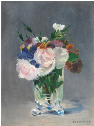
Édouard Manet (French, 1832–1883) Flowers in a Crystal Vase , ca. 1882, oil on canvas, 12 7/8 x 9 5/8 in. National Gallery of Art, Washington, D.C., Ailsa Mellon Bruce Collection, 1970.17.37