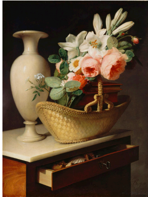
Antoine Berjon (French, 1754–1843) Bouquet of Lilies and Roses in a Basket on a Chiffonier , 1814, oil on canvas, 263/16 x 191/2 in. Musée du Louvre, Département des Peintures, Paris, RF 1974-10