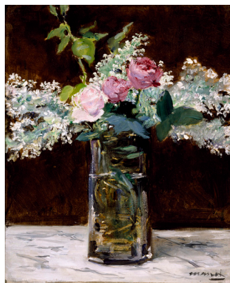
Édouard Manet (French, 1832–1883) Vase of White Lilacs and Roses , 1883, oil on canvas, 22 x 181/8 in. Dallas Museum of Art, The Wendy and Emery Reves Collection, 1985.R.34