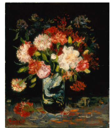
Vincent Van Gogh (Dutch, 1853–1890) Carnations , summer 1886, oil on canvas, 181/8 x 143/4 in. Collection Stedelijk Museum, Amsterdam, purchased with the generous support of the Vereniging van Hadendaagse Kunstaankopen, A2235