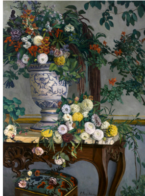
Frédéric Bazille (French, 1841–1870) Flowers , 1868, oil on canvas, 513/16 x 383/16 in. Musée de Grenoble, MG 2911