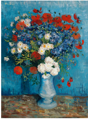
Vincent Van Gogh (Dutch, 1853–1890) Vase with Cornflowers and Poppies , 1887, oil on canvas, 31 1/2 x 26 3/8 in. Triton Collection Foundation