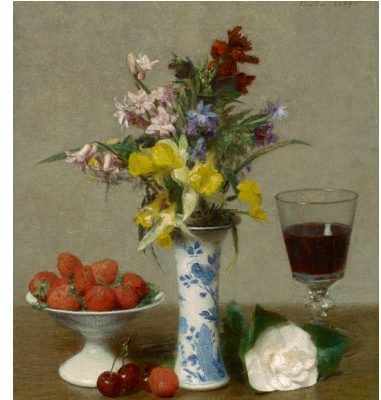
Henri Fantin-Latour (French, 1836–1904) The Engagement Still Life , 1869, oil on canvas, 1215/16 x 12 in. Musée de Grenoble, MG 2490