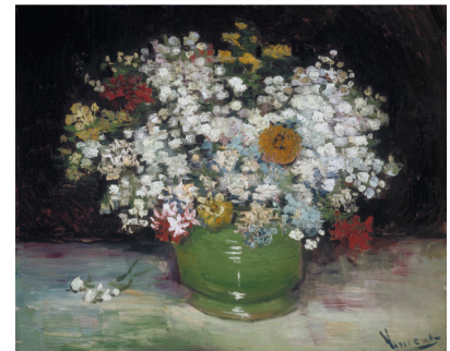
Vincent Van Gogh (Dutch, 1853–1890) Bowl with Zinnias and Other Flowers , 1886, oil on canvas, 19 3/4 x 24 1/16 in. (50.2 x 61 cm) National Gallery of Canada, Ottawa, Purchased 1951, 5808