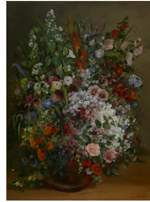
Gustave Courbet (French, 1819–1877) Bouquet of Flowers in a Vase , 1862, oil on canvas, 39 1/2 x 28 3/4 in. (100.5 x 73 cm) The J. Paul Getty Museum, Los Angeles, 85.PA.168