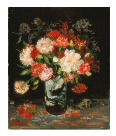
Vincent van Gogh (Dutch, 1853–1890) Vase with Carnations, summer 1886, oil on canvas, 181/8 x 143/4 in. Collection Stedelijk Museum, Amsterdam, purchased with the generous support of the Vereniging van Hadendaagse Kunstaankopen, A2235