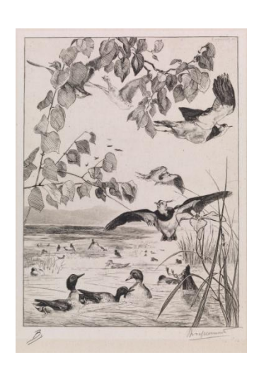
Félix Bracquemond (French, 1833–1914), Lapwings and Teals (Vanneaux et Sarcelles), 1862, etching, plate: 13¾"H × 9½"W; image: 10 5/16"H × 7 11/16"W. Gift of Frank Raysor

French printmaker and designer Félix Bracquemond (1833–1914) produced more than 800 etchings during a prolific career that spanned the late 19<sup>th</sup> century. Though celebrated from the outset of his career as a skilled reproductive etcher, Bracquemond enthusiastically championed the etching revival in France, prominently leading the charge toward redefining etching as a highly original art form. Despite his lived status as a luminary within Paris Salon and avant-garde artistic circles, including the Impressionists, Bracquemond is little known today. Félix Bracquemond: Impressionist Innovator re-introduces Bracquemond as an independently-minded, ever-industrious artist through a selection of more than 80 works on paper and tableware objects, among them his most imaginative portraits, landscapes, and groundbreaking reinterpretations of the Research of Bracquemond's distinctive images of hird