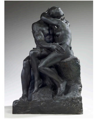
Auguste Rodin, The Kiss (reduction no. 1), 1898, bronze, Barbedienne foundry.