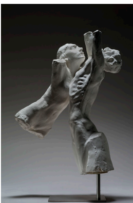
Auguste Rodin, Assemblage: Torso of the Centauress and Despairing Adolescent , about 1890, plaster.