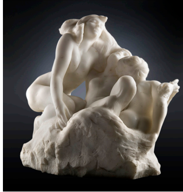
Auguste Rodin, The Sirens , ca. 1887-1888, marble, Montreal Museum of Fine Arts, gift of the Huntly Redpath Drummond family.