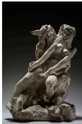
Auguste Rodin, The Minotaur, 1885-1886, plaster.