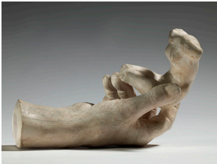
Auguste Rodin, Molding of Auguste Rodin's hand holding a torso, 1917, plaster.