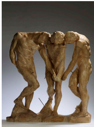
Auguste Rodin, Three Shades (small-size model), patinated plaster.