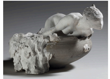
Auguste Rodin, Small Water Fairy (model), ca. 1903, plaster and terracotta.