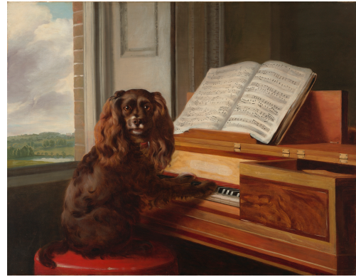
Portrait of an Extraordinary Musical Dog , 1805, Philip Reinagle, R.A. (British, 1749–1833), oil on canvas. Virginia Museum of Fine Arts; Paul Mellon Collection.