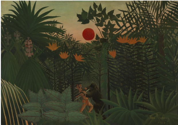
Tropical Landscape: an American Indian Struggling with a Gorilla, 1910, Henri Rousseau (French, 1844–1910), oil on canvas. Virginia Museum of Fine Arts; Collection of Mr. and Mrs. Paul Mellon.