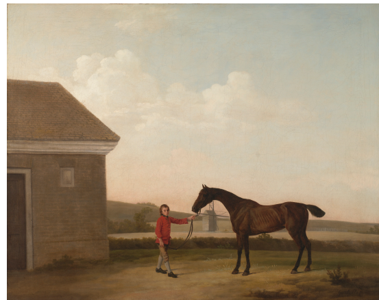
Hyena with a Groom on Newmarket , ca. 1767, George Stubbs (British, 1724–1806), oil on canvas. Virginia Museum of Fine Arts; Paul Mellon Collection.