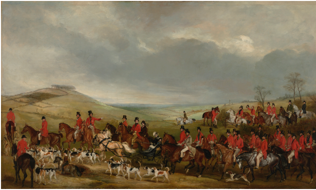
The Melton Hunt Going to Draw the Ram's Head Cover, 1839, Sir Francis Grant, P.R.A. (Scottish, 1803–1878), oil on canvas. Virginia Museum of Fine Arts; Paul Mellon Collection.