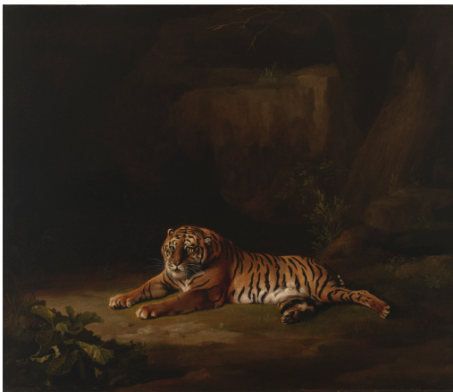
Tiger , ca. 1796–1770, George Stubbs (British, 1724–1806), oil on canvas. Virginia Museum of Fine Arts; Paul Mellon Collection.