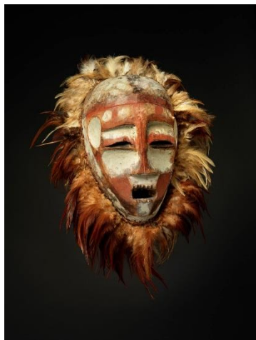
Face Mask with Feathered Collar , second quarter of the 20th century, Nyindu culture (Democratic Republic of the Congo), wood, pigment, rooster feathers, 15.3 in. high. Private Collection.