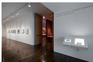
Installation view of Truthful Witnessing: The Black Photographers Annual, Volume 3 .

Free for VMFA members, children ages 6 and under, active-duty military personnel and their immediate families; $16 for adults, $12 for seniors 65 and older, and $10 for youth ages 7-17 and college students with ID