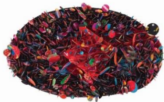
Untitled #5B (Krakatoa) , 2007, Howardena Pindell (American), mixed media on paper collage. Courtesy of the artist and Garth Greenan Gallery, New York.

Aug. 25 – Nov. 25, 2018 | 21 st Century & Evans Court Gallery