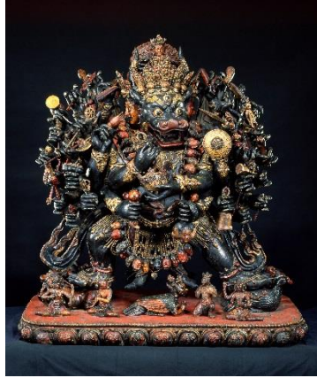
Vajrabhairava, 15 th century or later, Sino-Tibetan, polychromed wood. Virginia Museum of Fine Arts; Purchase with funds provided by the E. Rhodes and Leona B. Carpenter Foundation and the Arthur and Margaret Glasgow Fund.