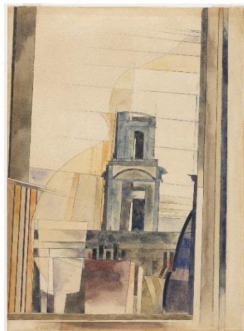
Roof and Steeple , 1921, Charles Demuth (American, 1883–1935), pencil and watercolor on paper. Virginia Museum of Fine Arts; Adolph D. and Wilkins C. Williams Fund.