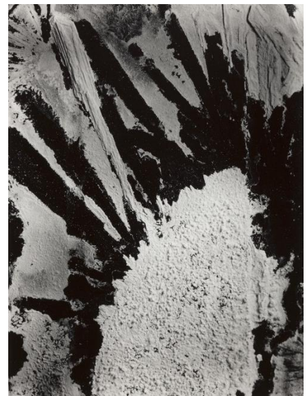
Sulfite White Figure with Spears, 1962 , printed later, Carl Chiarenza (American, born 1935), gelatin silver print. Gift of Carl Chiarenza, 2016.517

The Virginia Museum of Fine Arts in Richmond, Virginia, is one of the largest comprehensive art museums in the United States. VMFA, which opened in 1936, is a state agency and privately endowed educational institution. Its purpose is to collect, preserve, exhibit, and interpret art, and to encourage the