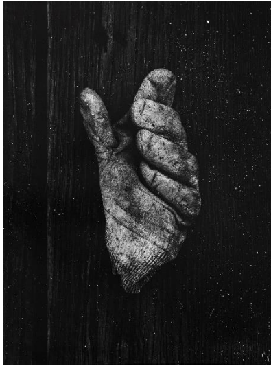
Aaron Siskind (American, 1903-1991), Gloucester, 1944, Gelatin silver print, Virginia Museum of Fine Arts, Gift of the Aaron Siskind Foundation, 2019

VMFA receives more than 8,000 photographs from the Aaron Siskind Foundation Gift represents the largest single donation of photographs in VMFA's history; VMFA will take over the administration of the Aaron Siskind Fellowship Prize.