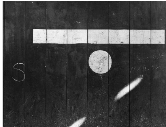
R: Aaron Siskind, (American, 1903-1991), Chicago, 1953, Gelatin silver print, Virginia Museum of Fine Arts, Gift of the Aaron Siskind Foundation, 2019

Richmond, Virginia — The Virginia Museum of Fine Arts has been given an extraordinary gift of more than 8,000 photographs by Aaron Siskind (1903–1991) from the Aaron Siskind Foundation in New York. Established by the artist in 1984, the foundation's mission has been to preserve and protect Siskind's artistic legacy, as well as to foster knowledge and appreciation for photography through research, publications, exhibitions and an annual fellowship prize for individual artists. The foundation recently decided to dissolve its operations and transfer the collection to an