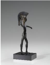
Etruscan, Statuette of a Warrior , 5th Century BC, bronze, 8 ¾ × 3 ½ × 2 ¾ in. (22.2 × 8.9 × 7 cm).