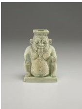
Vessel in the form of the God Bes (Cosmetic Container) , 650–550 BC, Egyptian (Dynasty 26, Late Period), faience, 5 5/8 × 3 25/32 × 3 3/8 in. (14.29 × 9.6 × 8.57 cm).