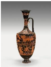
Red-Figure Lekythos , 4th century BC, attributed to the Underworld Painter (Greek, South Italian, Apulia), terracotta, 37 ¼ × 13 ½ in. (94.5 × 34.3 cm).