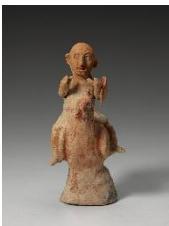
Figure of a Soldier Mime Riding a Rooster from a Funerary Set , 3rd century BC, (South Italian), polychromed terracotta, 7 ½ × 3 ½ × 5 3/8 in. (19.05 × 8.89 × 13.65 cm).