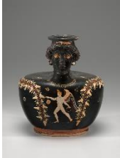
Gnathian Askos (Wine Flask) , circa 330 BC, attributed to the Rose Painter, South Italian (Gnathia), terracotta, 11 × 10 × 10 ½ in. (27.94 × 25.4 × 26.67 cm).

Permission is contingent upon the artworks not being cropped, detailed, overprinted, or altered; the work being fully credited; and the credit adjacent to all reproductions. Permission is for use in the context of the media story only; no cover use is permitted without prior authorization.