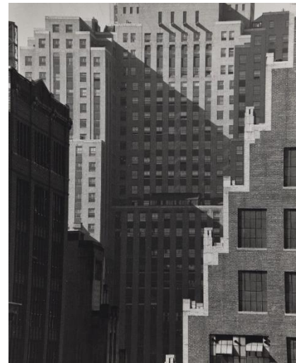
Lexington Avenue at 44th Street, New York , 1937, printed later, André Kertész (Kertész Andor) (American, born Hungary, 1894–1985), gelatin silver print, 20 5/8 x 16 5/8 x 1 1/2 in. Virginia Museum of Fine Arts, Gift of Judy Haselton, 2018.472