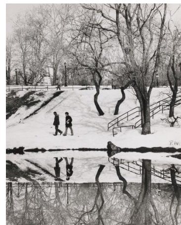
Central Park, New York, Winter Reflections, ca. 1960, Paula Wright (Paula Weisz) (American, born Hungary, 1930–2015), gelatin silver print, 20 5/8 x 16 5/8 x 1 1/2 in. Virginia Museum of Fine Arts, Kathleen Boone Samuels Memorial Fund, 2020.133