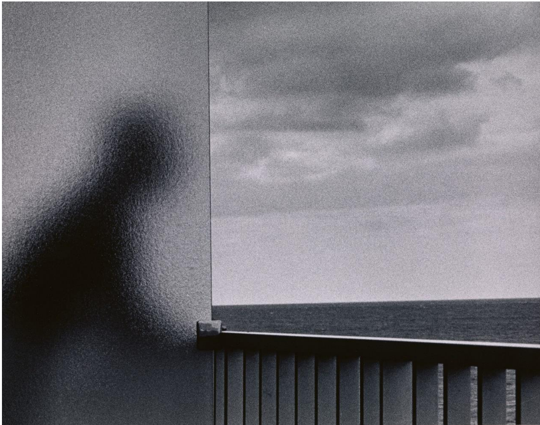
Martinique , 1972, printed 1970, André Kertész (Kertész Andor) (American, born Hungary, 1894–1985), gelatin silver print, 16 5/8 x 20 5/8 x 1 1/2 in. Virginia Museum of Fine Arts, Arthur and Margaret Glasgow Endowment, 2018.206

The impact of Hungarian American artists on 20th-century photography explored in VMFA's new exhibition