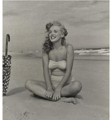
Marilyn Monroe , ca. 1949, André de Dienes (American, born Hungary, 1913–1985), gelatin silver print, 30 5/8 x 24 5/8 in. Virginia Museum of Fine Arts, Adolph D. Wilkins C. Williams Fund, 2021.598, Photograph © Andre De Dienes/MUUS Collection

For more information about American, born Hungary at the Virginia Museum of Fine Arts, visit www.VMFA.museum .