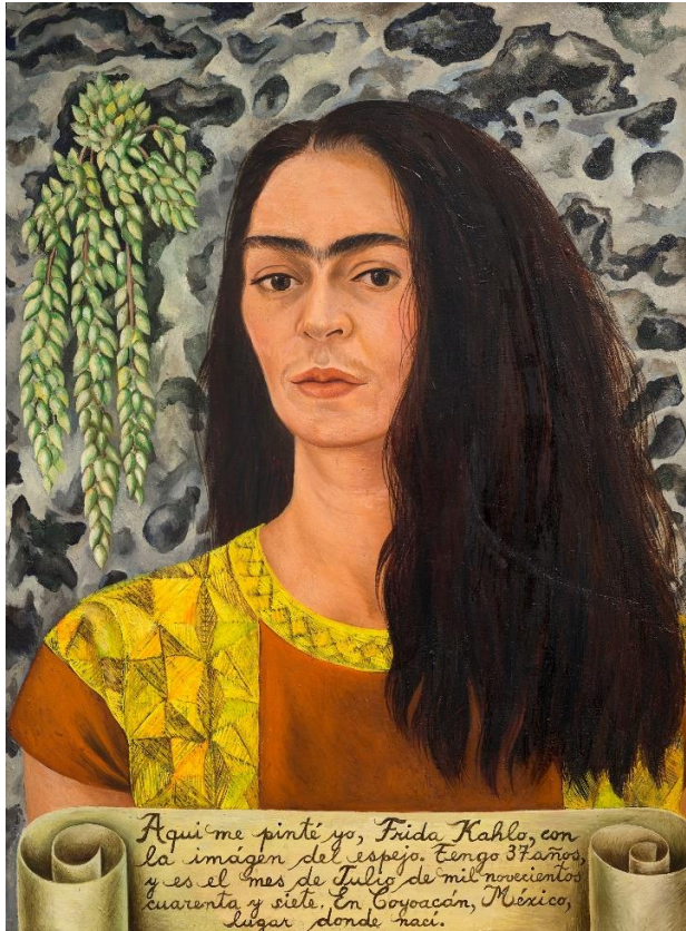
Self-Portrait with Loose Hair , 1947, Frida Kahlo (Mexican, 1907–1954), oil on masonite. Private Collection © 2025 Banco de México Diego Rivera Frida Kahlo Museums Trust, Mexico, D.F. / Artists Rights Society (ARS), New York

Tickets for Much Anticipated Exhibition Frida: Beyond the Myth Go on Sale February 1 Virginia Museum of Fine Arts — one of only two U.S. venues — will open the exhibition with ¡FridaFest!