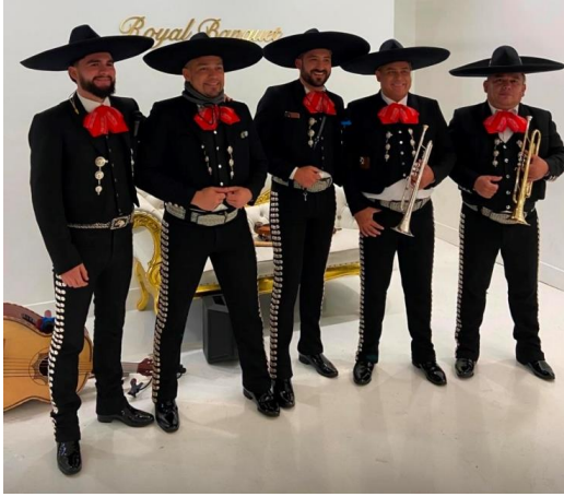
Mariachi America RVA, which specializes in traditional Mexican music, made its debut in 2024.

the United States — and the only East Coast venue — to present the exhibition Frida: Beyond the Myth , we are delighted to provide rare firsthand access to Kahlo’s art and to introduce our museum to new audiences.”