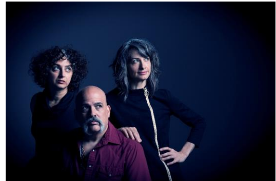
Miramar reimagines the Latin American love song known as the bolero, drawing inspiration from classic Mexican, Puerto Rican and Cuban combinations with a retro rock-and-roll edge.