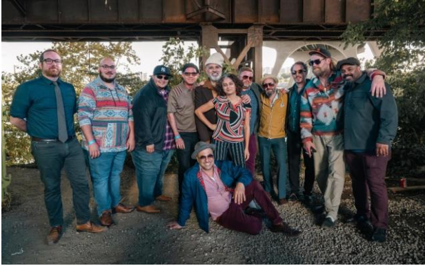
Critically acclaimed band Bio Ritmo creates its own unique sound by mixing musical influences and building on the rhythms of salsa.