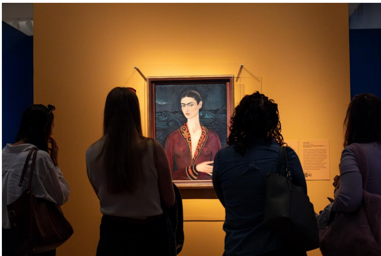
Visitors gaze at one of Frida Kahlo's early self portraits, included in Frida: Beyond the Myth at VMFA. Self-Portrait in a Velvet Dress , 1926, Frida Kahlo (Mexican, 1907–1954), oil on canvas. Private Collection © 2025 Banco de México Diego Rivera Frida Kahlo Museums Trust, Mexico, D.F. / Artists Rights Society (ARS), New York

Powerful works by celebrated Mexican artist Frida Kahlo are on view at the Virginia Museum of Fine Arts through September 28, 2025