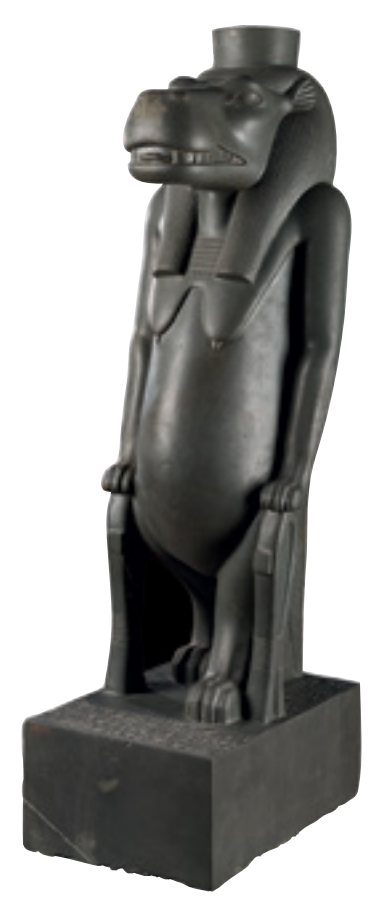
The Goddess Taweret, Luxor. Egyptian Museum, Cairo (CG 39145)

Taweret is a combination of a few different animals. Can you tell which ones?