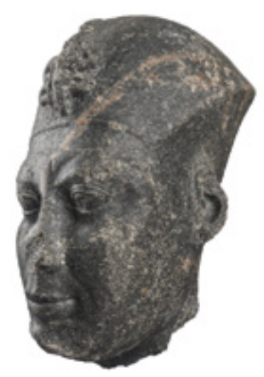
Head of a Pharaoh, Canopus, Aboukir Bay. Bibliotheca Alexandrina Antiquities Museum, Alexandria. IEASM Excavations (SCA 168)