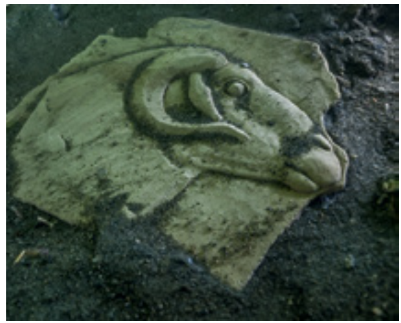
Plaque with Amun as a Ram, Thonis-Heracleion. Maritime Museum, Alexandria. Bottom photo shows the object on the seafloor during excavation. IEASM Excavations (SCA 1579)