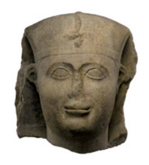
Head of a Pharaoh , Canopus, Aboukir Bay. Bibliotheca Alexandrina Antiquities Museum, Alexandria. IEASM Excavations (SCA 166)

Why might a pharaoh want to be connected with a poisonous snake?