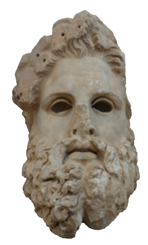
Marble Colossal Head of Zeus from Aigeira, Achaia. National Archaeological Museum, Athens, Greece, 3377

This is a sculpture of Zeus made around the same time as the Serapis sculptures in this gallery. How are the two sculptures different? How are they alike?