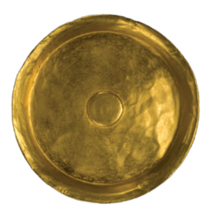
Phiale, Thonis-Heracleion. Alexandria National Museum. IEASM Excavations (SCA 296)

What kinds of gifts do you like to give?